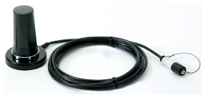
Figure 5: LTE antenna

The new LTE modems operate on a different frequency than the old 2G 1xRTT modems; therefore, they need a different antenna. The new antenna (604804035) looks visually the same as the previous antenna except for the connector being white (Figure 5). This new antenna operates from 700 MHz–2500 MHz so it can be used for all Teledyne ISCO cellular products.