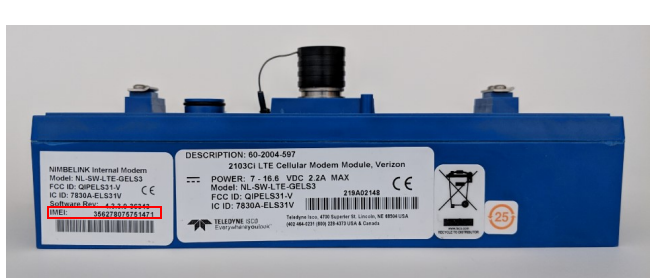
Figure 2: Location of IMEI number

The M2M plan, with text messaging enabled, will use bytes, not minutes, and will allow for alarm text messages to be sent from the sites if you wish to set up alarm conditions. If the provider asks, the hardware for these units will be: Nimbelink Skywire NL-SW-LTE-TC4NAG modem. Typical usage would be less than 5MB per month.