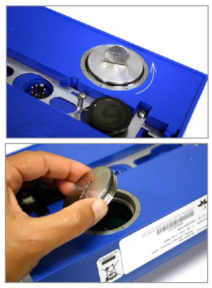
Figure 3: Removing the SIM cover

1. Remove the SIM cover on the bottom of the 2103 or 2105 using a coin or tool (Figure 3).