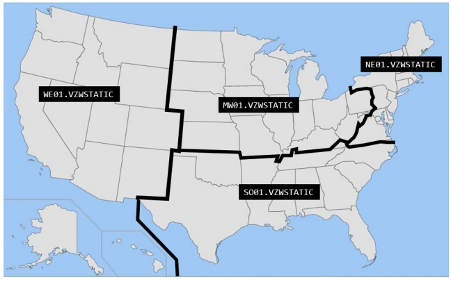
Figure 7: APN location map

If you have questions about APN set up on the Verizon network, please contact the Product Support Group at 1- 866-298-6174.