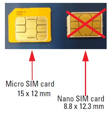
Figure 1: Types of SIM cards

In order to use this device, you will have to establish service with your carrier and obtain a SIM card. Teledyne ISCO LTE modems work with Micro SIM cards (Figure 1).